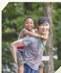
(Bottom left, clockwise) Shelters of Saratoga, Franklin Community Center, Double H Ranch