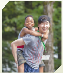
(Bottom left, clockwise) Shelters of Saratoga, Ballston Spa Central School District, Double H Ranch